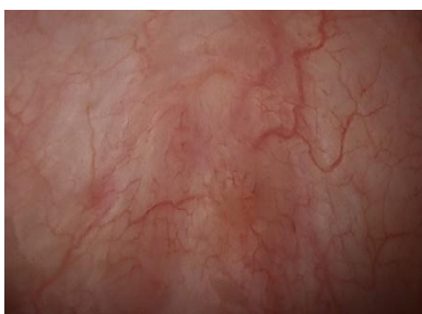
Fig 1: Normal Bladder

You will have some or all of the above symptoms. Your gynaecologist will do tests to rule out other diseases which may cause similar symptoms. These may include tests for bladder or vaginal infections, bladder cancers or endometriosis. Your gynaecologist may also perform a test called a cystoscopy, which involves placing a small camera into your bladder to evaluate the appearance of the bladder wall. At the time of cystoscopy, the bladder is filled with saline and inspected for particular features such as bleeding spots (petechiae) or splitting of the bladder wall lining (fissures). If women suffer from the above symptoms, but we cannot identify these changes within the bladder, the condition is called painful bladder syndrome (PBS). If these features are present at cystoscopy, a diagnosis of interstitial cystitis (IC) is made (a subset of PBS)